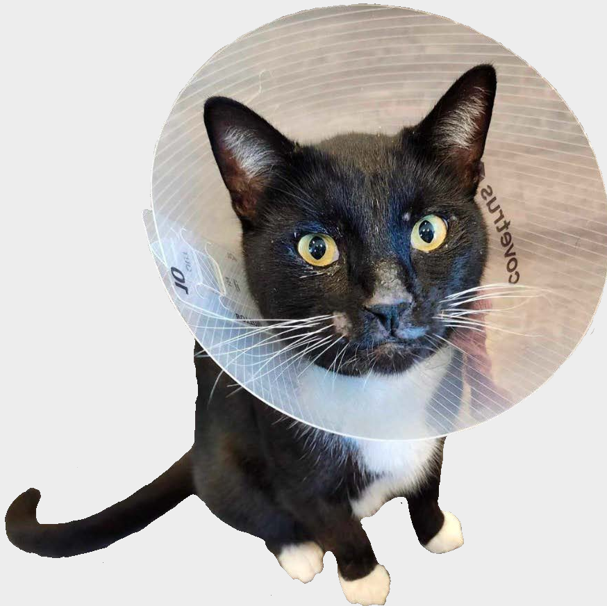
Chex, $SKITTENS first mascot

#SKITTEN believes in the power to protect the innocent and make the world better—for us and for vulnerable kittens. We have the chance to give millions of kittens a healthy, secure life while earning lasting rewards. It's also an opportunity to show that the crypto space can be a force for good, not the scam many believe it to be.