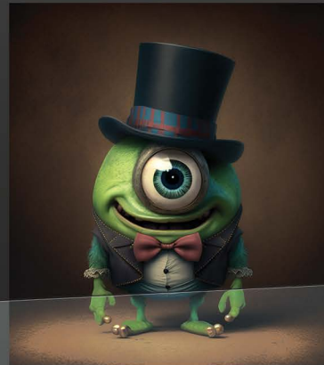
MONSTERS MASTER t.me/KryptoTruman