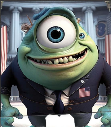
LEAD DEV/OWNER t.me/THE0XGOVERNOR